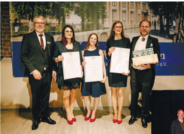
Graduation ceremony at the at the ZVA Akademie (Knechtsteden, Germany)

Graduation ceremonies for the EDO have taken place at the ZVA Akademie (Knechtsteden, Germany), at the Fachhochschule Nordwestschweiz, (Olten, Switzerland), at the University of South-Eastern Norway (Kongsberg, Norway) and at the University of Applied Sciences Utrecht (Utrecht, the Netherlands). The OHI GmbH, Optometrie & Hörakustik Initiative (Vienna, Austria) awarded the EQO during their ceremony.