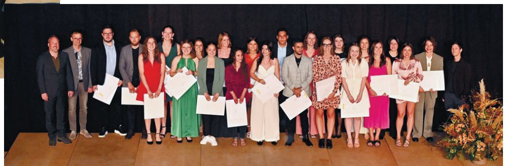
Graduation ceremony at the Fachhochschule Nordwestschweiz, (Olten, Switzerland)

The accreditation team has kept busy in the second half of this year with visits to the Institut des Sciences de la Vision in St Etienne, France and a visit planned in November to the University of Latvia. In light of the increasing interest in the accreditation scheme, ECOO has also expanded its pool of visitors.