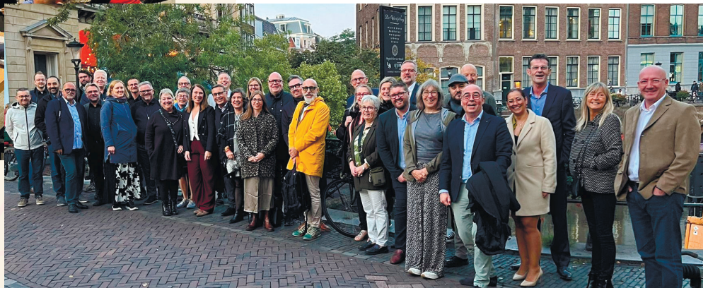
ECOO delegates on their way to dinner in Utrecht